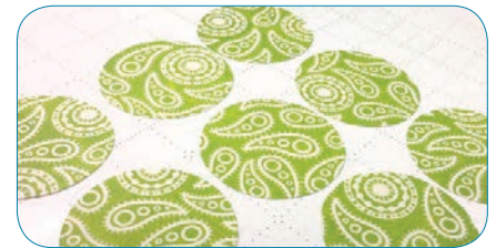
Carefully remove your circles with a spatula.

You're done. It should look kinda like this. Congratulations, you just decorated the air with a floating painting.