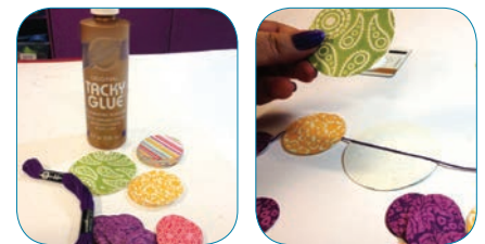
Paper, string and glue. That's it!