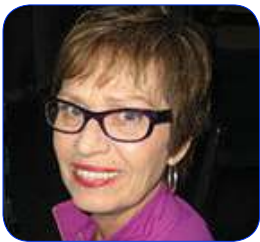
By Lynn Swanson Brother Canada Educator

Guaranteed to spread some joy to any special girl or boy!