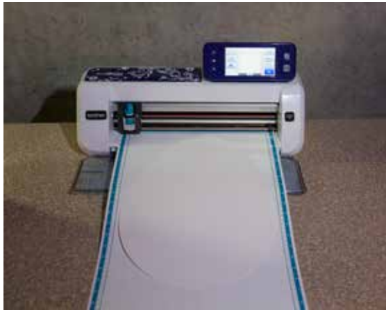
ScanNCut 12" x 24" Standard Mat